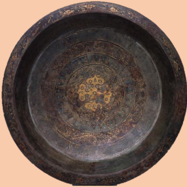
Bronze Dish with bird, animal, and cloud design in gold China, Former Han-Xin Dynasty, 3rd century B.C.-1st century A.D. National Treasure

on display from Tuesday, March 17 to Wednesday, April 15