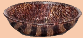
Glass Gold-band Bowl the Eastern Mediterranean Basin, 2nd-1st century B.C.