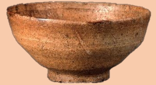
Tea Bowl Kakinoheta type Korea, 16th century