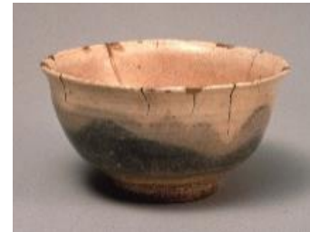
Tea Bowl Known as "Natsuyama" ("Summer Mountain") Korea, Yi Dynasty, 16th-17th century