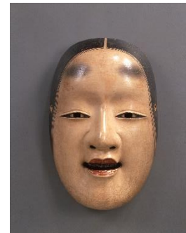
Noh Mask, Magojiro Edo period, 17th century