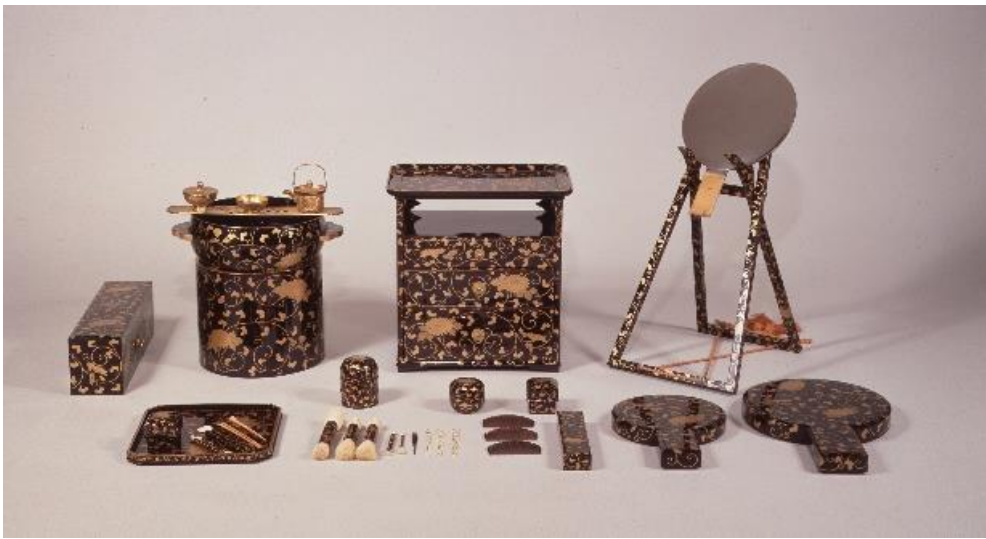
Cosmetic Set with design of chrysanthemum scrolls in maki-e Edo period, 19th century