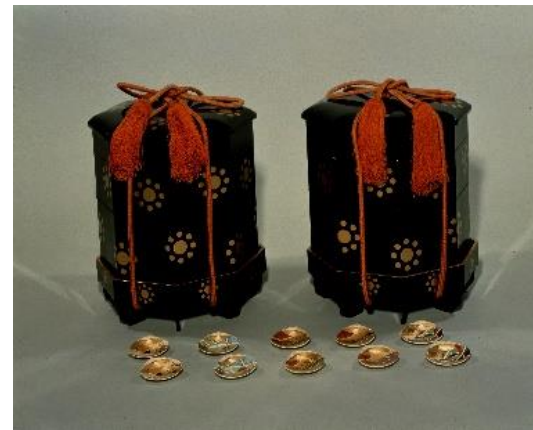
▪ Pair of Shell Game Boxes with nine-planet family crests in maki-e ▪ Shells for Shell-matching Game Edo period, 19th century